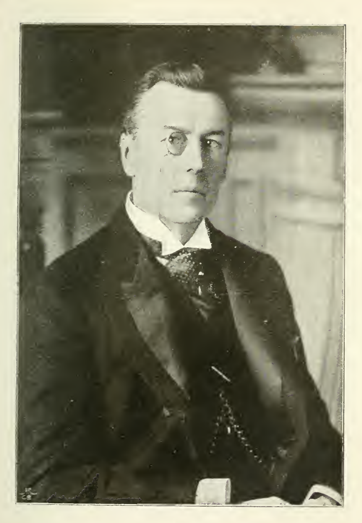
JOSEPH CHAMBERLAIN