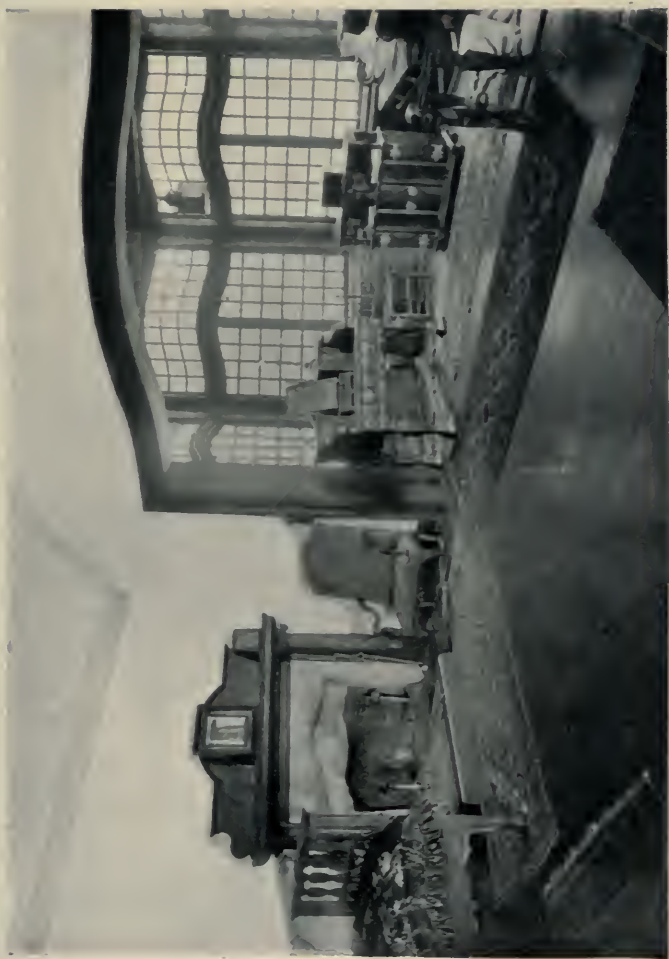
RHODES'S BEDROOM AT GROTE SCHUUR.