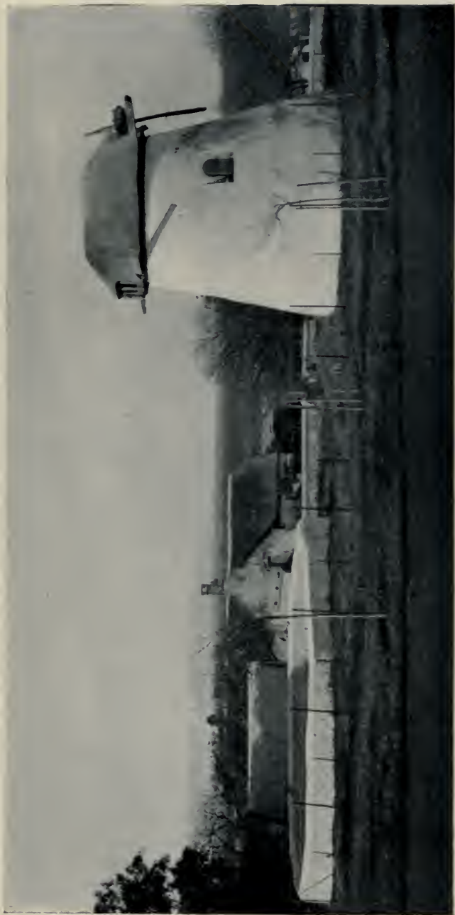
DUTCH EAST INDIA COMPANY'S MILL.