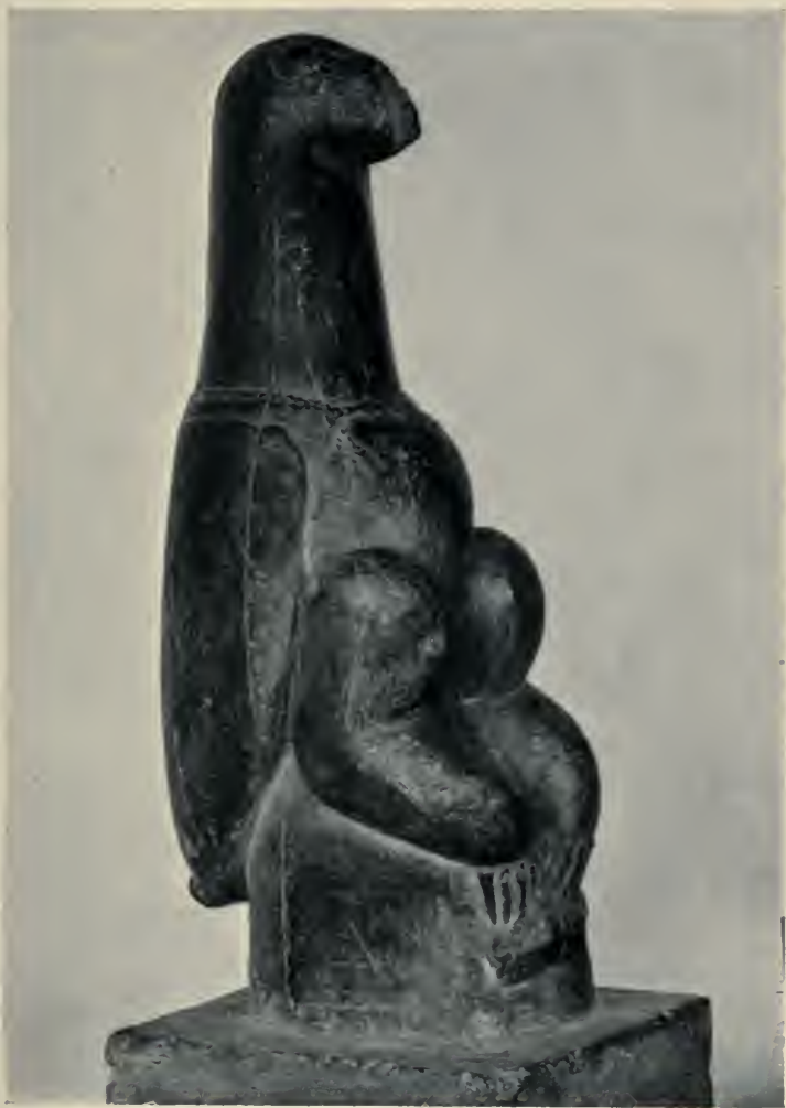
SOAPSTONE BIRD FROM ZIMBABWE RUINS.